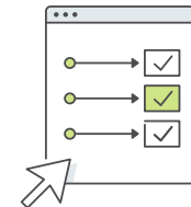
One Click Failover